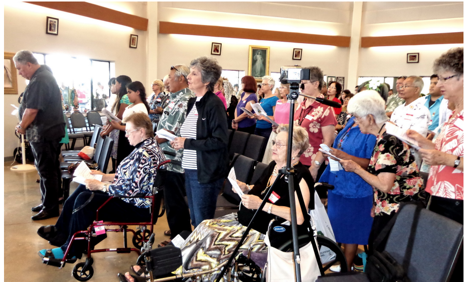
Below: Some of the crowd of friends who gathered with us to celebrate the July 11 solemnity of St. Benedict and our "new beginnings."

reflections on the changes in our newsletter or things you would like to see. We hope to provide more info on our transition and life in general on our web site: www.hawaiibenedictines.org The name Benedictine Monastery of Hawaii remains the valid legal title for the monastery, while Mary, Spouse of the Holy Spirit Monastery will be an additional legal title once the application is